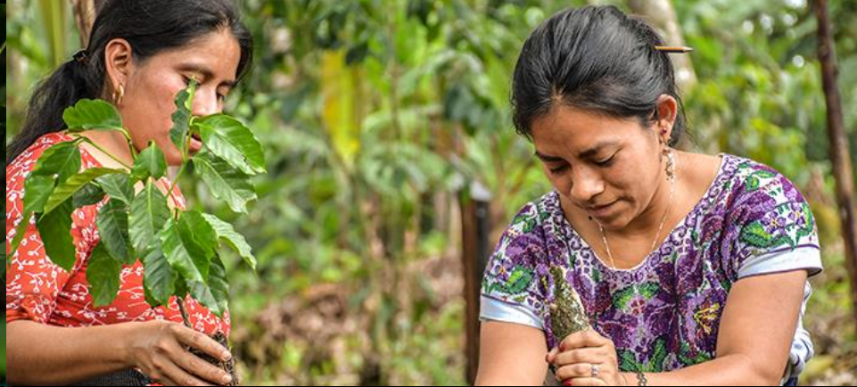
FECCEG | GUATEMALA

Waykana is an exporter of guayusa, a caffeine-rich leaf native to the Ecuadorian Amazon rainforest. The company works with over 100 small-scale indigenous Kichwa farmers who earn, on average, more than $3,500/yr selling directly to Waykana. This predictable income incentivizes sustainable agroforestry practices that preserve the rainforest and its biodiversity. The Reciprocity Fund provided a $30,000 loan so Waykana could acquire a cutting machine that improves the consistency of their dry guayusa.