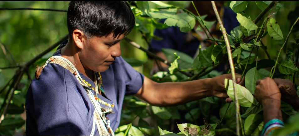
WAYKANA | ECUADOR

Waykana is an exporter of guayusa, a caffeine-rich leaf native to the Ecuadorian Amazon rainforest. The company works with over 100 small-scale indigenous Kichwa farmers who earn, on average, more than $3,500/yr selling directly to Waykana. This predictable income incentivizes sustainable agroforestry practices that preserve the rainforest and its biodiversity. The Reciprocity Fund provided a $30,000 loan so Waykana could acquire a cutting machine that improves the consistency of their dry guayusa.